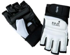
Gloves (or similar)