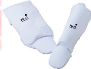
Shin guards (or similar)